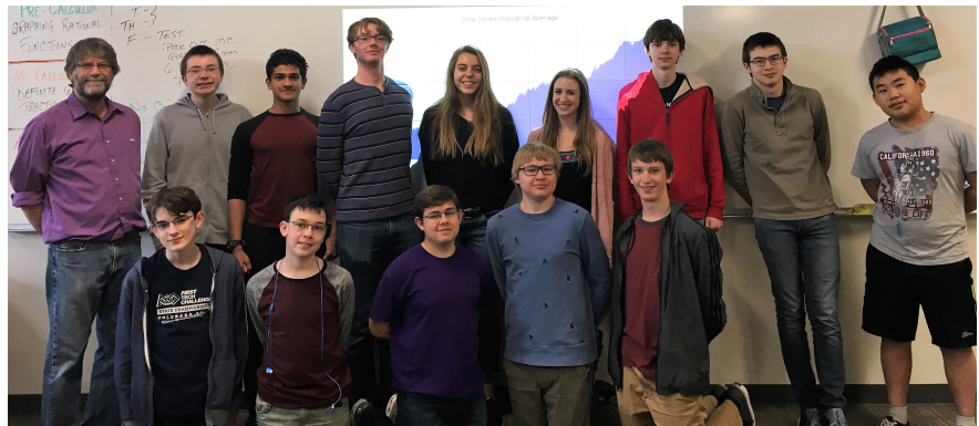
Stargate High School YIS, Colorado

It's exciting to look ahead to what will no doubt be an amazing end of the year for Young Investors Society, as we approach the Global Stock Pitch Competition. The kids have been preparing all year for this, and we expect teams from over 16 US states, and over six countries to participate. The state and regional competitions will be held during April, and the Global Stock Pitch Finals will be held on May